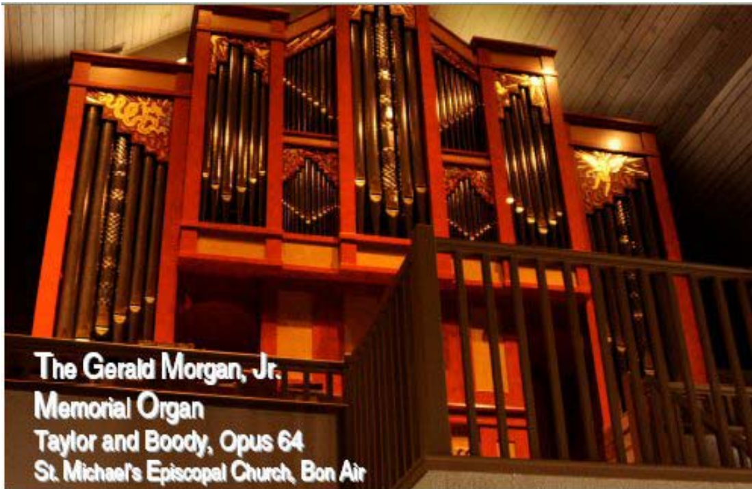
The Gerald Morgan, Jr. Memorial Organ Taylor and Boody, Opus 64 St. Michael's Episcopal Church, Bon Air