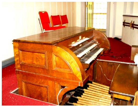
(Above: Photos of the Wurlitzer in its former home at Berryman prior to removal)