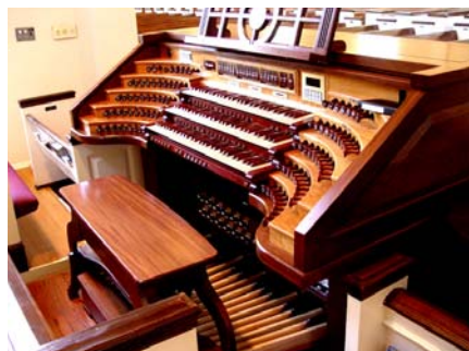
Photos of Peragallo Opus 711