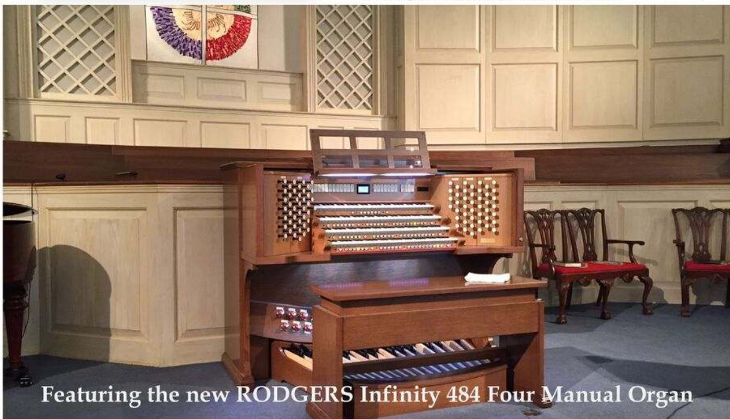
Featuring the new RODGERS Infinity 484 Four Manual Organ