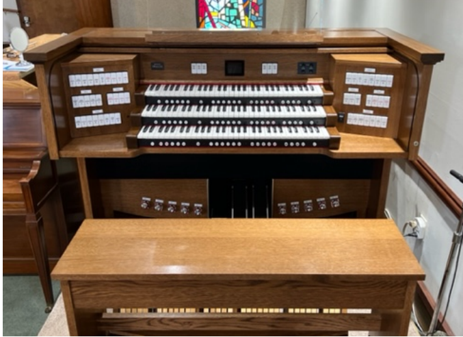
St. James Catholic Church, Conway, SC Imagine 351-T