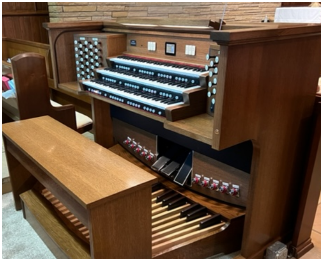
Macedonia Lutheran Church, Burlington, NC Imagine 351-M

The 351 is available with Mechanical Drawknobs, Lighted Drawknobs, and Lighted Stoptabs.