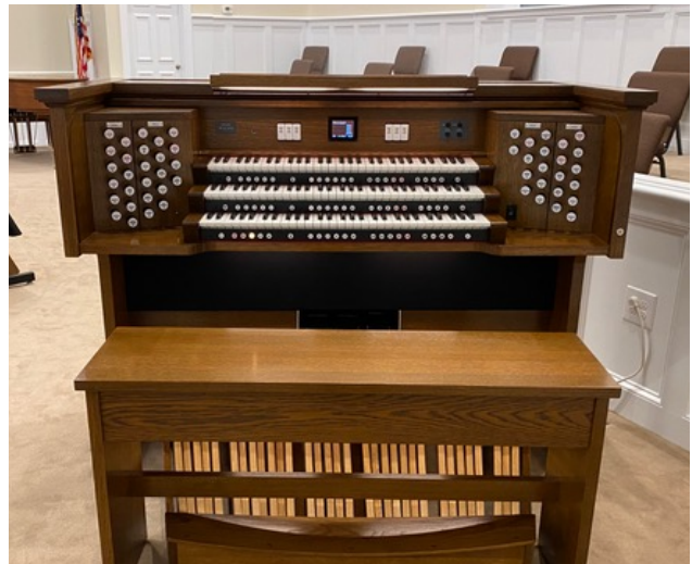
Cedar Falls Baptist Church, Fayetteville, NC Imagine 351-D