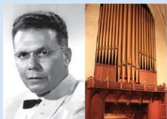
Virgil Fox Brown Memorial Presbyterian Church

Recitals and lectures displaying diverse approaches to the organ in the 20th century, guiding toward a pedagogy of organ and sacred music in the 21st century.