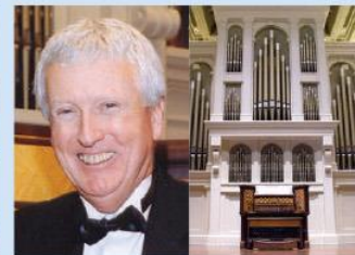
Donald Sutherland Peabody Institute, Leith-Symington Griswold Hall