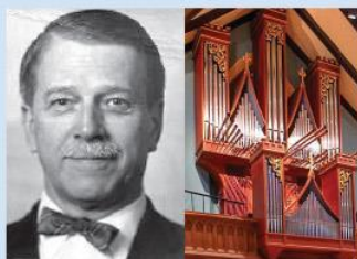
Arthur Howes Mount Calvary Catholic Church