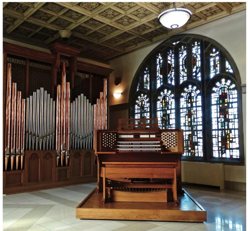
THEOLOGICAL COLLEGE, WASHINGTON, D.C.

is a full-line representative for pipe, digital, and hybrid organ solutions.