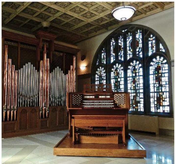
THEOLOGICAL COLLEGE, WASHINGTON, D.C.

is a full-line representative for pipe, digital, and hybrid organ solutions.