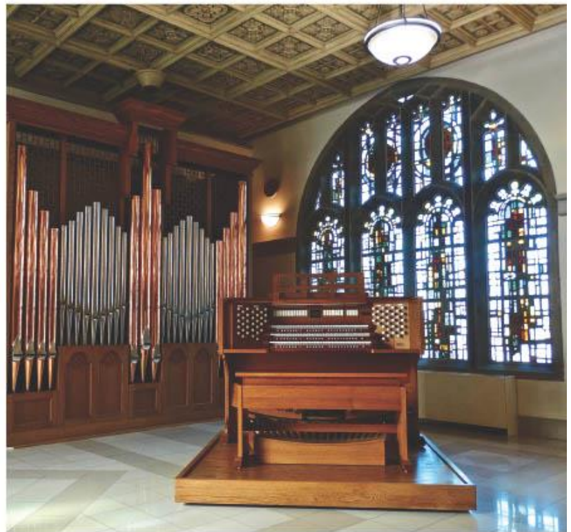
THEOLOGICAL COLLEGE, WASHINGTON, D.C.

is a full-line representative for pipe, digital, and hybrid organ solutions.