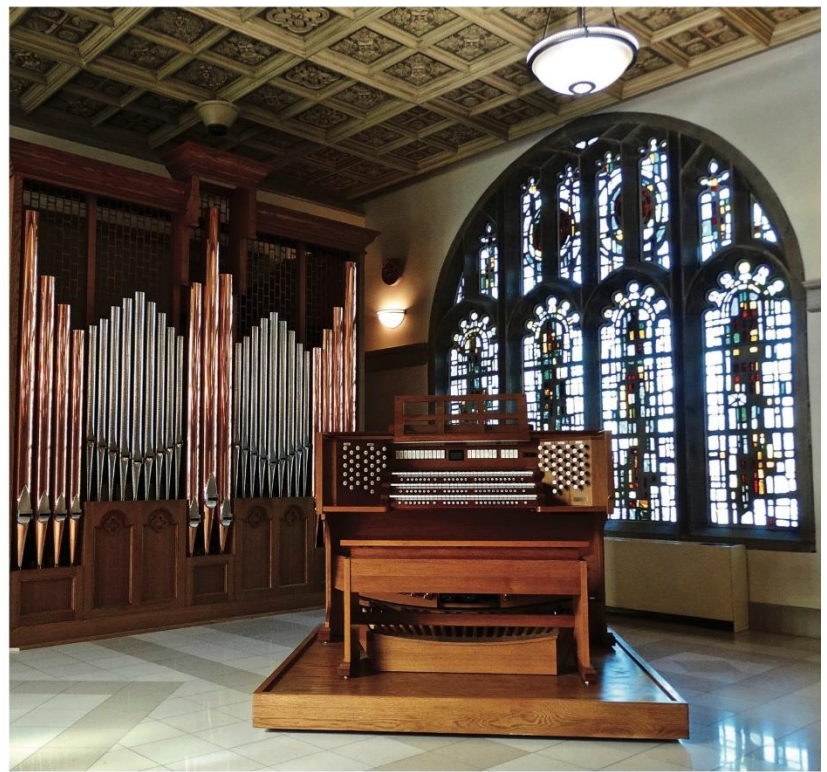
THEOLOGICAL COLLEGE, WASHINGTON, D.C.

is a full-line representative for pipe, digital, and hybrid organ solutions.