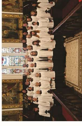
GHTC Parish Choir at the church's Centennial Celebration on June 2, 2024