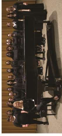
VCU's Vox Concordia Treble Choir & Vocal Chamber Ensemble