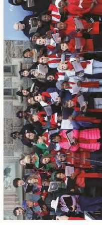
All Choirs Singing during the Fourth Annual Caroling in Monroe Park & Holiday Market of 2024

The Greater Richmond Children's Choir, Hood Temple Music Ministry, RVA Street Singers, Grace & Holy Trinity Vocal Ensemble, and a brass quintet will lead Christmas carols for this fifth annual holiday event. There will be a holiday market, food trucks, and fun children's activities starting at 3:00 p.m. The brass quintet music will begin at 4:15 p.m. with caroling following at 4:30 p.m.