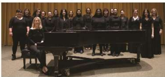
VCU's Vox Concordia Treble Choir & Vocal Chamber Ensemble