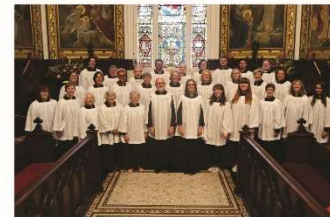
GHTC Parish Choir at the church's Centennial Celebration on June 2, 2024