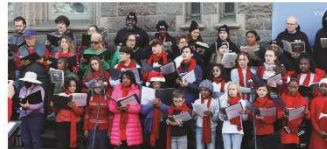
All Choirs Singing during the Fourth Annual Caroling in Monroe Park & Holiday Market of 2024

The Greater Richmond Children's Choir, Hood Temple Music Ministry, RVA Street Singers, Grace & Holy Trinity Vocal Ensemble, and a brass quintet will lead Christmas carols for this fifth annual holiday event. There will be a holiday market, food trucks, and fun children's activities starting at 3:00 p.m. The brass quintet music will begin at 4:15 p.m. with caroling following at 4:30 p.m.