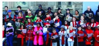
All Choirs Singing during the Fourth Annual Caroling in Monroe Park & Holiday Market of 2024

The Greater Richmond Children's Choir, Hood Temple Music Ministry, RVA Street Singers, Grace & Holy Trinity Vocal Ensemble, and a brass quintet will lead Christmas carols for this fifth annual holiday event. There will be a holiday market, food trucks, and fun children's activities starting at 3:00 p.m. The brass quintet music will begin at 4:15 p.m. with caroling following at 4:30 p.m.