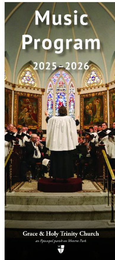
Grace & Holy Trinity Church an Episcopal parish on Monroe Park

Grace & Holy Trinity Church 8 N. Laurel Street • Richmond, VA 23220 (804) 359-5628 ghtc.org