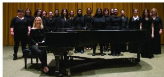
VCU's Vox Concordia Treble Choir & Vocal Chamber Ensemble