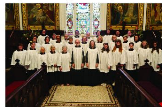
GHTC Parish Choir at the church's Centennial Celebration on June 2, 2024